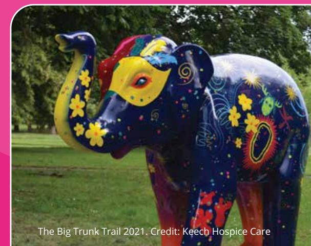
The Big Trunk Trail 2021.

They remember the places where other elephants have died, and linger there when they pass them.