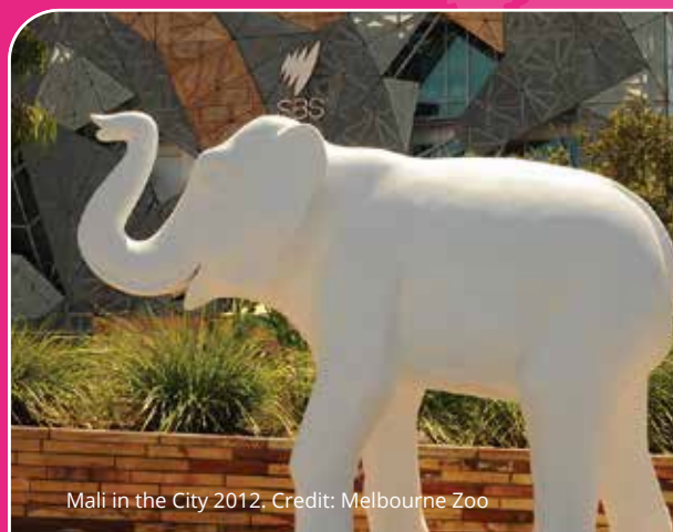
Mali in the City 2012.

They have characteristics synonymous with the nature of the care St Giles Hospice provides for patients every day.