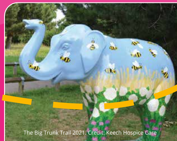
The Big Trunk Trail 2021.

The compassion, dedication and courage provided through hospice care is reflected in the behaviour elephants show towards their herd whilst alive and after death.